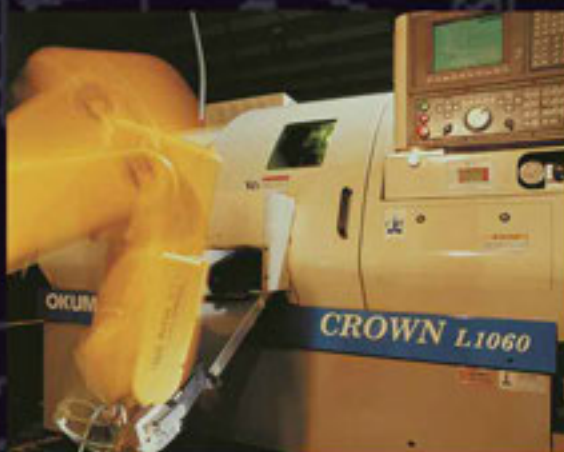
This Okuma Crown L1060E turning center with Fedek bar feeder employs a state-of-the-art Fanuc 6-Axis Robot.

At MTM, improvement never ends. We are continually growing, adding, updating, and innovating to maintain our leadership as a "World Class" tool & machining supplier. We are committed to staying abreast of the latest technologies and equipment and investing in them as needs surface. This philosophy has led to MTM's growth as one of the most equipped, capable, and technologically advanced machining facilities in the country.