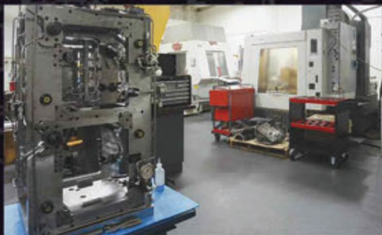
Our prototype/fixture room is supported by engineers, the latest software, and our "Top Gun Machinists" to provide extremely elaborate fixture builds.