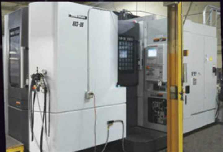
MTM specializes and excels in Horizontal Machining Capabilities. Our numerous machining centers allow us to produce high quality parts with several backup stations to support high-demand schedules.