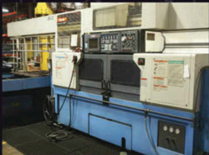
We operate a variety of turning centers, including this Mazak Multiplex 6300Y twin spindle/twin turret 6-Axis Center with a Gantry Robot, the most efficient turning center made.