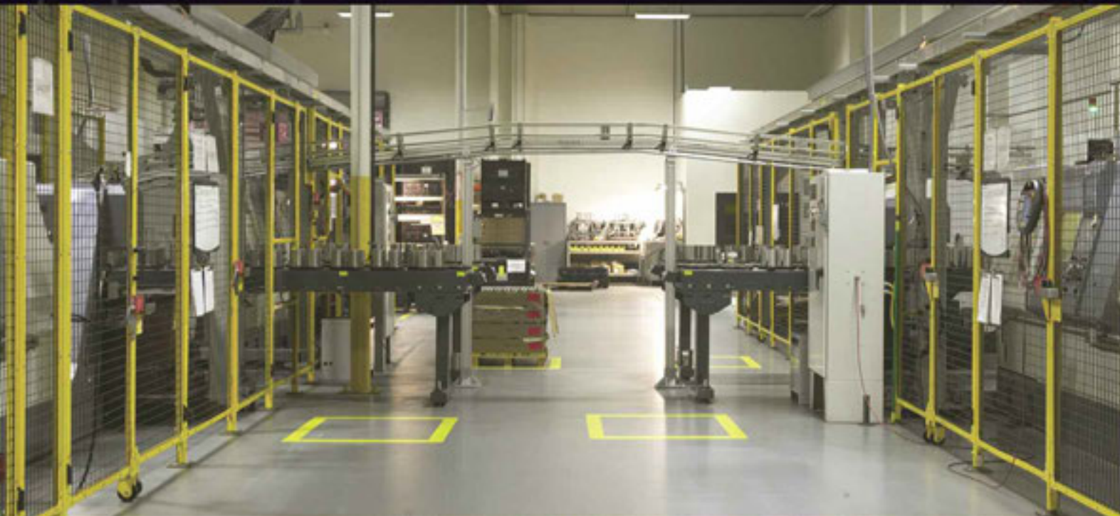
5-Axis Automated Mazak Mark III Integrexes with Gantry Loaders. This fully automated cell is the "State-of-the-Art" in automation design developed by MTM's own engineers. We are able to reduce overhead costs by utilizing this 8 machine cell under the supervision of a single operator.