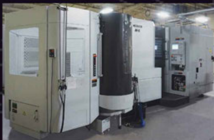
Our DMG Mori NHX 5500 5-pallet pool horizontal machining center provides unsurpassed performance, precision, reliability and production value for high-volume operations.