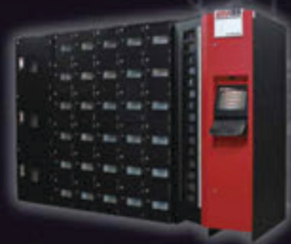
Tooling inventory is monitored via vending machines to reduce costs and maximize efficiency with automated reorder software.

In the tool & machining industry, lasting relationships are dependent largely upon the skill of our work force. At MTM, we are committed to the ongoing training and development of our team to keep them on the leading edge of technology and performance. We invest diligently in apprenticeship programs and maintain a company in-house training resource group. These advancement opportunities and programs translate into employee pride, consistently high quality and complete customer satisfaction.