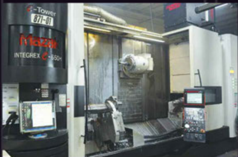
"Done In One" – This 5-Axis CNC Mazak E-650H Integrex allows us to complete very intricate and difficult operations in minimal time.