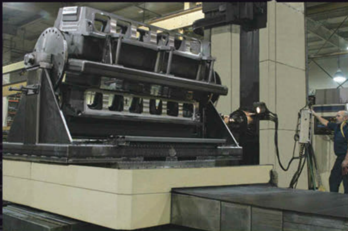
Efficient, consistent production is standard on our CNC Toshiba BTD13 horizontal boring and milling machines. Each machine has a programmable rotary index table.